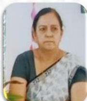
Coordinator & Trainer: